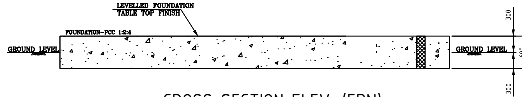
CROSS SECTION ELEV. (FDN)