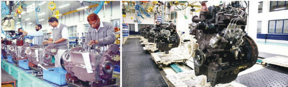
Eicher Engines are Manufactured and Marketed by TAFE Motors and Tractors Limited, under a license from Eicher Goodearth Private Limited. "EICHER" is the exclusive trademark of Eicher Goodearth Private Limited.

TMTL Engines Division is one of the fastest growing engines manufacturers in India. Backed by a strong, vast and ever-expanding service network it enjoys a dominant market share in the Telecom segment where timely and quality service is a critical factor. TMTL Engines Division's flagship product, 125 kVA genset, is one of the most technologically advanced gensets in India with indigenously developed CRDI engine and Isochronous Governing, which is helping TMTL carve a unique identity for itself in its quest to truly become #IndiaKaEngine.